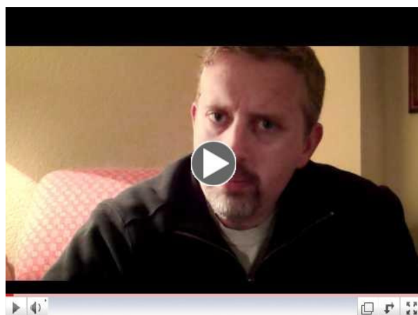
TAHRA April Video Newsletter

Please make sure that you take a look and consider attending the State HR Conference in Norman in a few weeks. The venue, the programs, the speakers and education credits will be better than we ever seen. (Even better than last year in Tulsa, hard to be believe but they DID IT!)