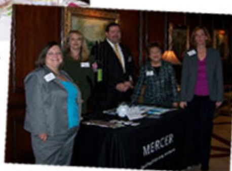
Thanks to Mercer for sponsoring our March program meeting!