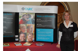
Representative from TARC