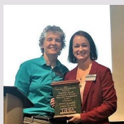
Richard J. Messer Excellence in Human Resources Management Award

At our January Program Meeting and Volunteer Recognition, TAHRA announced our annual award winners. Each year TAHRA recognizes two members who have displayed outstanding leadership and achievements in the Human Resources field. Join TAHRA in congratulating the winners for their commitment to advancing the HR profession.